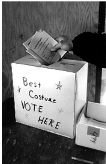
THE SELF-SERVE BALLOT BOX IN THE WARMING SHACK IN THE PROCESS OF BEING STUFFED.

Back at the warming shack individuals and entire teams filed in, filled in as many ballots as made them comfortable, and then went on to do something