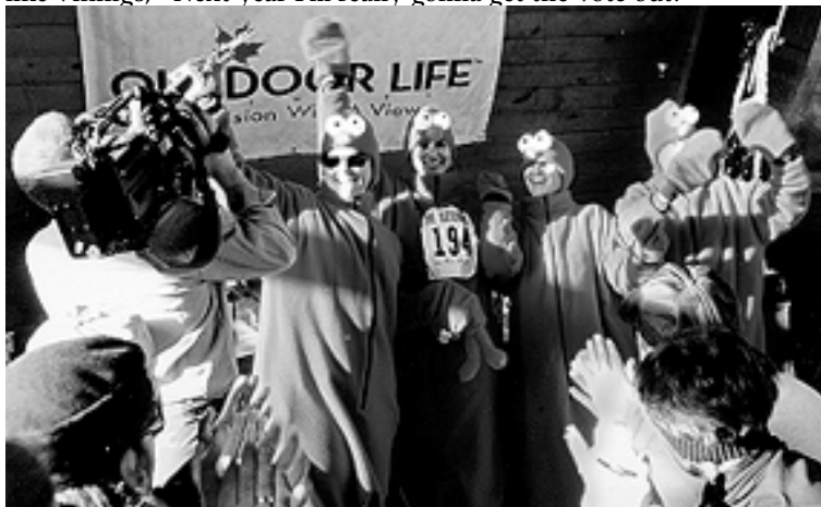
The Four Elmos of West Warwick, RI, pose in their red outfits for the video camera and the crowd at the awards ceremony. The team won first place in the costume contest.

There were bitter feelings from some teams that fell short on the votes. On the one hand they lost, but on the other hand it wasn't clear if anybody broke any rules, even though they may have broken with tradition. "I didn't know people were going to stuff [the ballot box] like that." Said one female member of a team that looked a lot like Vikings, "Next year I'm really gonna get the vote out!"