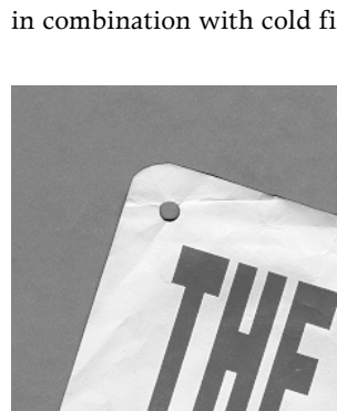
THE THUMB-SAVING PRE-PUNCHED HOLE FEATURE